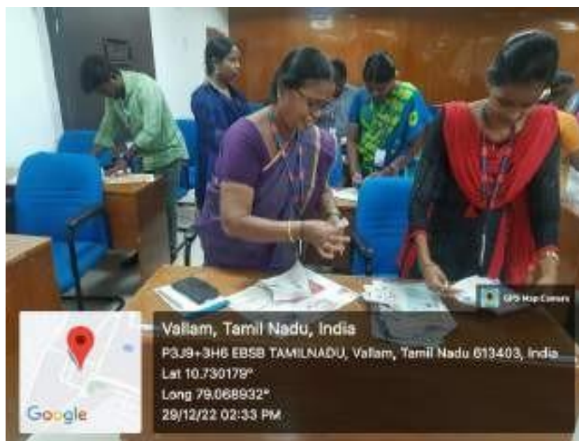
Participants involving in various tasks to understand the nuances of record maintenance